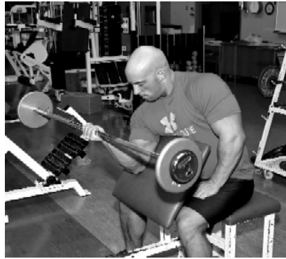
Isometric 1-arm BB preacher curl